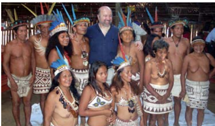
Hernando de Soto (centre) with Bora natives in San Andrés, Iquitos.

In the much-celebrated science fiction film Avatar , a greedy mining company plots to drive the indigenous population of the moon Pandora away from their traditional forest homeland so as to exploit its precious resources. These plans are foiled when a former United States (US) marine, who is part of the mercenary unit hired to execute the mission, goes native and leads a popular counter-attack. Directed by the imaginative US filmmaker James Cameron, Avatar clearly struck a chord with movie audiences around the world. Many of us automatically supported the film's messages: that the world's indigenous peoples were content with their traditional lives; that they thrived in a Rousseau-like state of harmony with their environment; and that they certainly had no interest in participating in their nation's market economies, never mind globalisation.